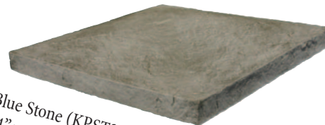
Blue Stone (KPST24-04) 24" x 24" x 4.5"