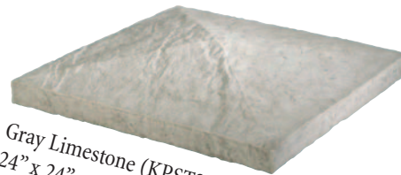
Gray Limestone (KPST24-02) 24" x 24" x 4.5"