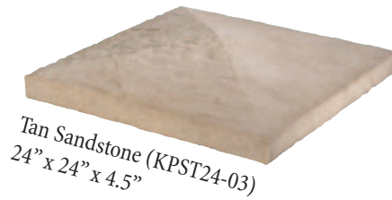
Tan Sandstone (KPST24-03) 24" x 24" x 4.5"

Keystone KapStones are available in the most popular wall colors, making it easy for you to incorporate them into your project.