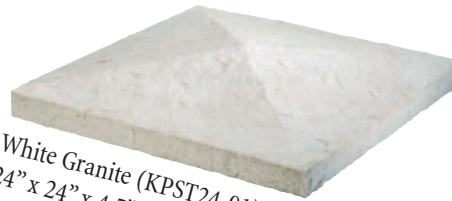
White Granite (KPST24-01) 24" x 24" x 4.5"