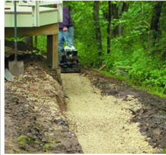
PREPARE THE BASE LEVELING PAD