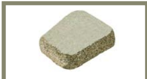
LARGE UNIT 3" H x 10" D x 9" / 11" W 22 lbs.