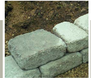
INSTALL ADDITIONAL COURSES