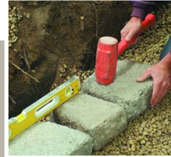
INSTALL THE FIRST COURSE