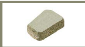
SMALL UNIT 3" H x 10" D x 4" / 6" W 12 lbs.